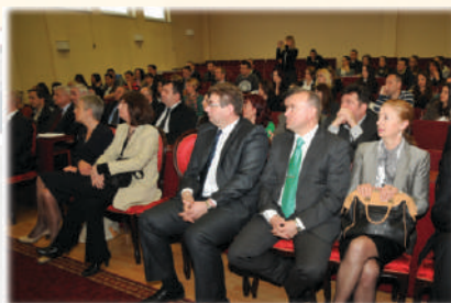
Signing the Cooperation Agreement with the representatives of business community of BiH