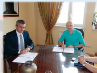
Signing the Cooperation Agreement with the Associations of Insurance Companies of the Republic of Srpska.

The outcome of such practical work is that those students, by completion of their study, have found their first employment opportunity in those organisations.