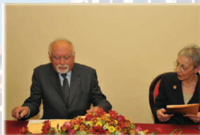
Signing the Cooperation Agreement with High School of Business and Management "Baltazar Adam Krcelic", Zagreb

Inter-alia, we have signed the cooperation agreements with the following: