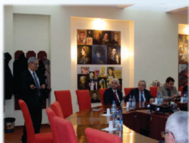
Signing the Cooperation Agreement with the Technical University of Cluj-Napoka, Romania

The bilateral contracts with above mentioned institutions enable students and lecturers' mobility, exchange of academic experiences, organisation and participation at international scientific meetings, exchange of teaching literature and participation at scientific-research projects.