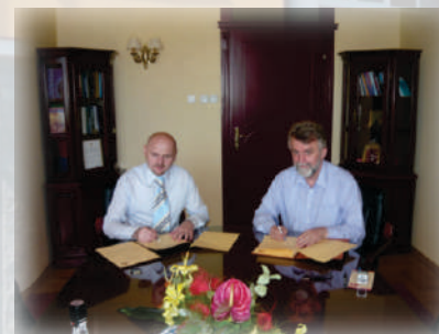
Signing the Cooperation Agreement with the EDA development Agency