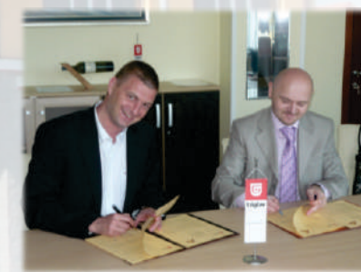
Signing the Cooperation Agreement with the Triglav Insurance Company