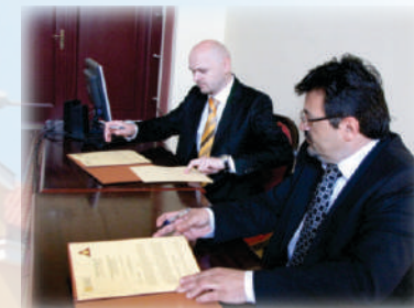
Signing the Cooperation Agreement with the Small and Medium Enterprises Agency, Banja Luka